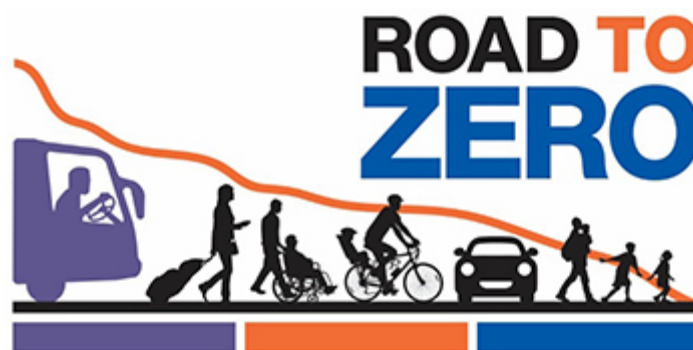
Road to Zero graphic.