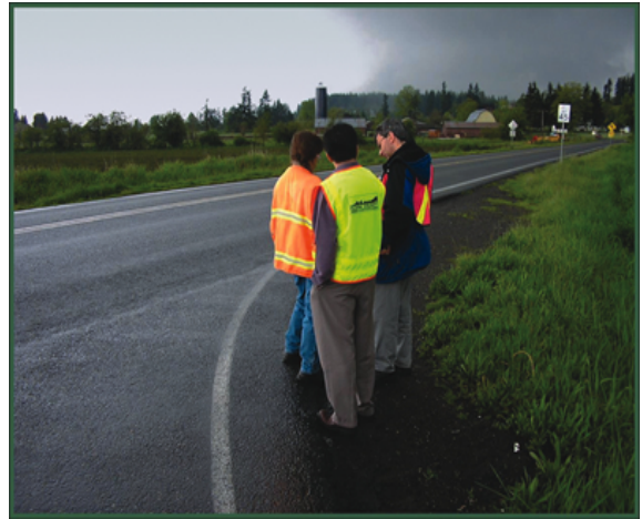
Road Safety Audits.