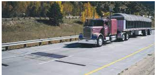
Weigh-in-Motion Systems.