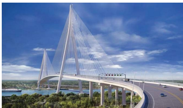
Gordie Howe International Bridge.