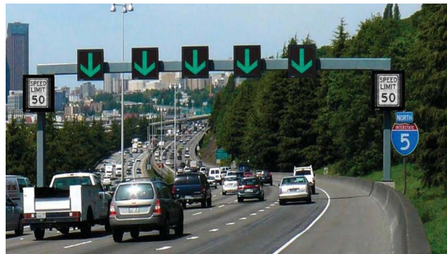
Lane control signals.