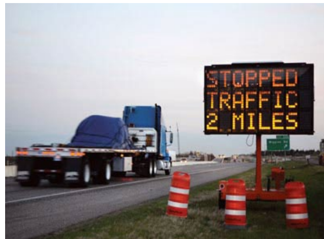
Queue warning system.