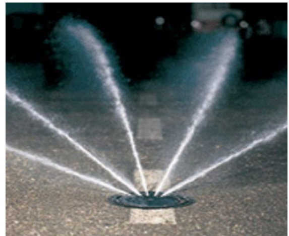
Fixed Automated Spray Technology.