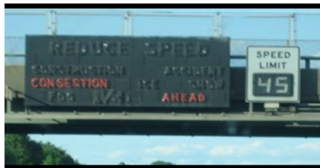
Variable speed control.