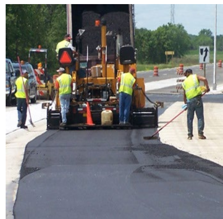
Warm-mix asphalt.