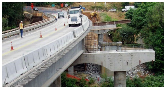
Prefabricated Bridge Construction.