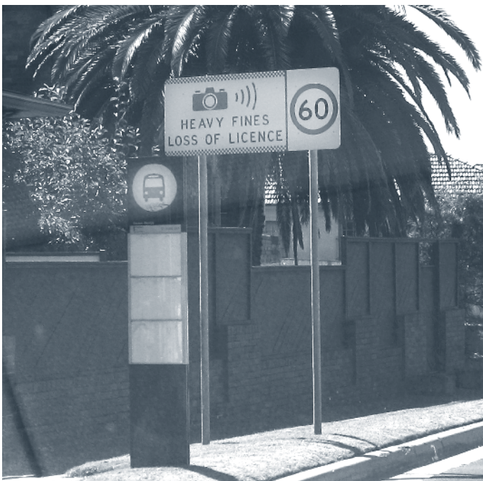
Figure 3. Automated speed enforcement warning sign in Sydney, Australia.

Another consequence of this focus on frailty is an emphasis on reducing crash severity, not just crash frequency. The performance metrics the Australian agencies use combine fatal and severe injury crashes into a single “road tolls” category. These agencies recognize that reducing severity includes making changes in vehicle and roadside safety, in addition to roadway design and operations. The focus of crash reduction is not just eliminating fatalities, but rather reducing the severity of all crashes. The main operational change used to reduce crash severity is lowering vehicle speeds. Reducing speed especially benefits older road users because of their frailty. Throughout Australia, the general focus was on speed reduction to improve outcomes for both vehicle-vehicle crashes and vehicle-pedestrian crashes. Both New South Wales and Victoria widely use automated speed enforcement (i.e., speed cameras) in an effort to curtail speed-related injuries (see figure 3). In addition to automated enforcement, legislatively mandated speed limits are imposed in areas with high pedestrian traffic. These include schools, shopping districts, and entertainment precincts (see figure 4). Reducing speeds also allows more time for older drivers and pedestrians to react to events. This is important for older road users because response times, on average, tend to increase with age.