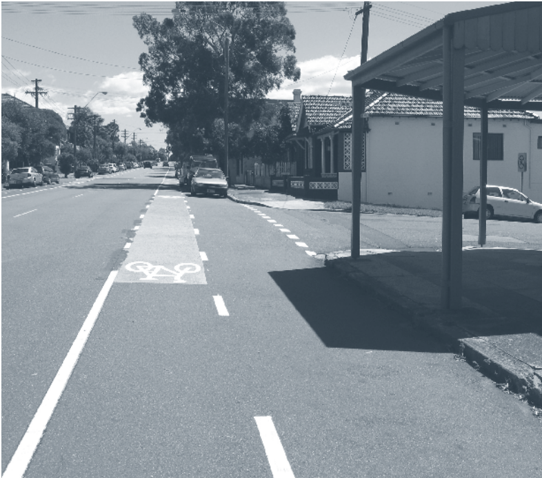
Figure 17. Green-colored pavement used to highlight a bicycle lane as it crosses an unsignalized intersection in Sydney, Australia.