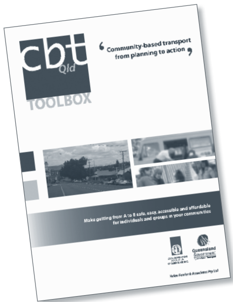
Figure 7. Local Government Association of Queensland Community-Based Transport Toolbox.

priorities for infrastructure improvements. It calls this plan Mieruka, which translates as “visualization,” to stress the importance of looking at data while identifying issues and setting priorities.