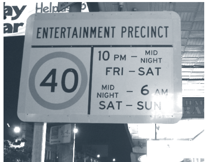
Figure 4. Reduced speed zone in high-pedestrian traffic area in Brisbane, Australia. Similar speed zones exist in other Australian states for shopping districts and school zones.

A theme running through road safety programs in each Australian state was that addressing fragility involves more than focusing exclusively on driver and pedestrian behavior. The focus needs to be on vehicle and roadside safety as well. The rationale for this perspective is that since road users will continue to make errors, road safety programs should attempt to minimize the consequences of those errors. One way to minimize the consequences of driver error is to provide more forgiving roadsides by eliminating pavement edge dropoffs, providing flatter cross-slopes, and installing roadside safety devices such as guardrails. Roadside safety approaches such as these were observed in both countries the scan team visited.