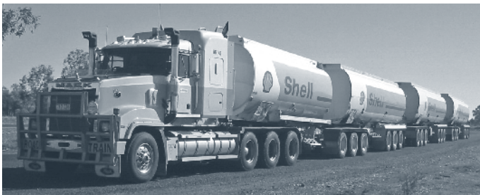
Figure 21. Example of a road train heavy vehicle used in rural Australia.

slower to notice a hazard such as an unexpected vehicle entering their lane. This delay is likely because of both slowed response time and the wider gaze pattern, which lessens the probability of looking in the critical location at the time the vehicle pulls out. (57,58)