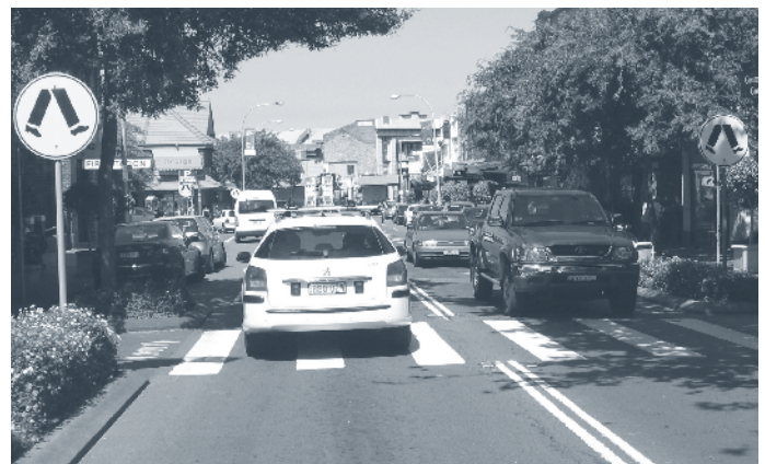
Figure 12. Raised crosswalk with curb extensions in Sydney, Australia.

In Australia, pedestrians were also the focus of many infrastructure improvements. These improvements aid all pedestrians, not just older persons, by providing better visibility of the crosswalk to approaching vehicles. Figure 12 shows a raised crosswalk with curb extensions in Sydney. This design shortens the walking distance for pedestrians, reducing the time they are exposed to traffic. The curb extensions also bring the pedestrian closer to the travelway, making the waiting pedestrian more visible to approaching motorists. Figure 13 shows a shopping area that uses curbside fencing and landscaping to channelize pedestrians to the crosswalks. In addition to parking restrictions near crosswalks, the landscaping provides a mechanism to provide bump-outs that shorten the