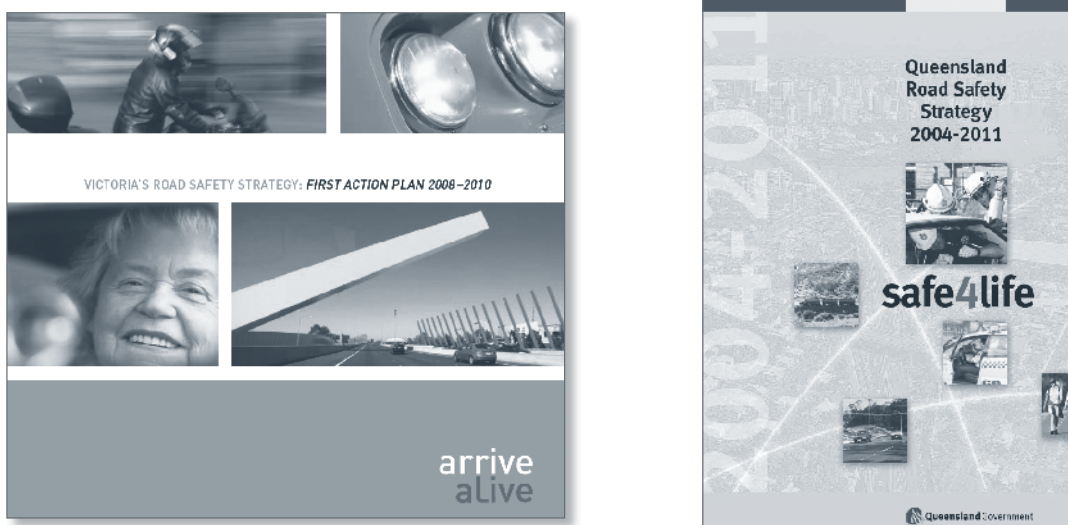
Figure 5. Examples of state strategic road safety plans in Australia.

In the United States, federal legislation (Safe, Accountable, Flexible, Efficient Transportation Equity Act: A Legacy for Users (SAFETEA-LU)) mandates each State to develop its own strategic highway safety plan. To date, 24 of 50 States