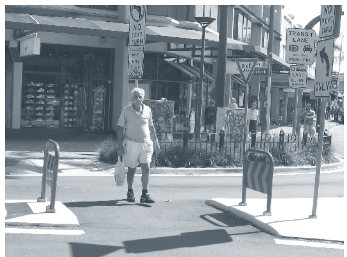
Figure 13. A pedestrian crossing with refuge islands and gates in Sydney, Australia.