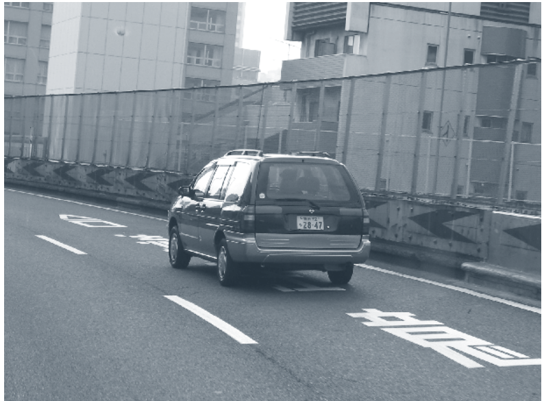
Figure 9. Median barrier treatments and pavement marking text in Tokyo.

In Japan, horizontal curves on expressways are enhanced through the placement of retroreflective materials on concrete median barrier walls and guard rails, as figure 9 shows. The Japanese also make widespread use of text and symbols in pavement markings. The text used on expressways shown in figure Figure 9 lists a destination city name before a major interchange.