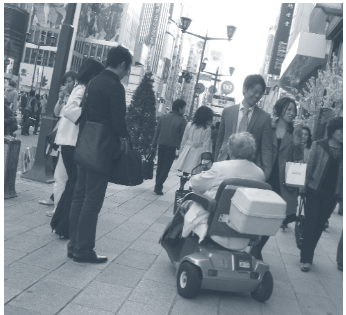
Figure 19. An elderly shopper using a mobility scooter in Tokyo, Japan.

The last trend on the horizon in Australia is an increase in recreational vehicle ownership among older people—the so-called “graying nomads.” As in the United States, retiring baby boomers are buying motor homes and camping trailers and going on extended driving trips. In Australia these trips pose a particular hazard because of the poor-quality roads in much of the country’s interior. In addition, these remote roads are used by long-haul tractor-trailers