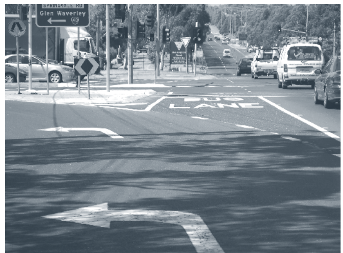
Figure 16. Red-colored pavement used to mark a bus queue-jump lane at a signalized intersection in Melbourne, Australia.

In both countries, the scan team noticed the frequent use of colored pavements for a variety of purposes. Australia used red to prohibit normal vehicular traffic from bus and taxi lanes (see figures 16 and 18) and green to emphasize bicycle lanes in high-hazard areas (see figure 17). Japan was experimenting with colored pavement to mark high-hazard horizontal curves. Crash data from one location shows a large reduction in run-off-road crashes, particularly for large trucks. Japan was also experimenting with using colored pavement as a tool for positive guidance and