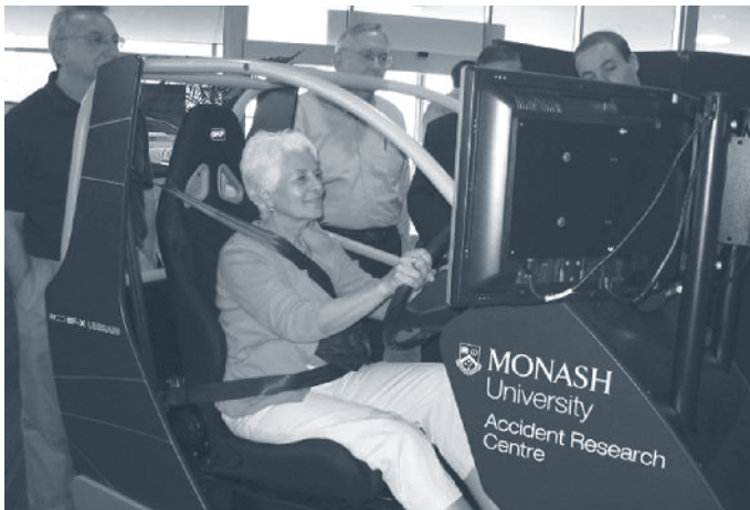
Figure 20. Scan team members test the Monash University Accident Research Centre driving simulator.

A study at Monash University Accident Research Centre (MUARC) uses a portable driving simulator located in a car dealership (see figure 20). This is a large-scale study examining driving patterns at intersections and other high-risk traffic maneuvers and hazards in drivers of all ages. In similar previous studies, MUARC researchers have shown that older drivers have a wider gaze pattern when negotiating some hazardous events, which in general is safer. But researchers also found that older drivers are