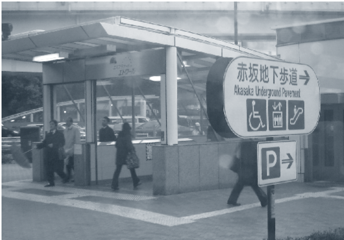
Figure 10. Underground pedestrian walkway under a busy urban intersection in Tokyo.