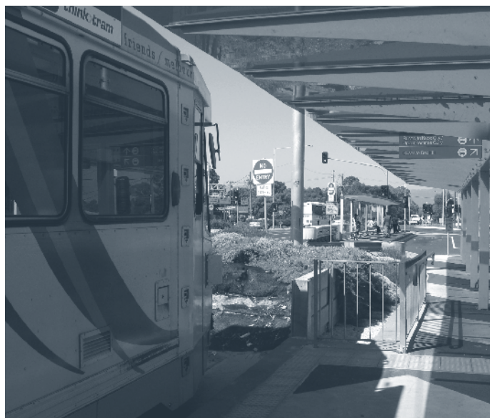
Figure 15. Tram-bus transfer station in Melbourne.

Some cities, such as Melbourne, are making improvements to transit infrastructure to enable easy boarding and transferring for elderly and disabled riders. The transfer station located in the median of a suburban arterial street shown in figure 15 allows tram riders to exit the tram at the end of the line and board local buses without crossing the street. In general, after discussions with experts in both countries, the scan team believed that the low level of paratransit services was comparable to those in the United States. This was particularly true in rural areas. Both Japan and Australia have laws equivalent to the Americans with Disabilities Act, but it appeared that these laws had not been in place as long as the U.S. law.