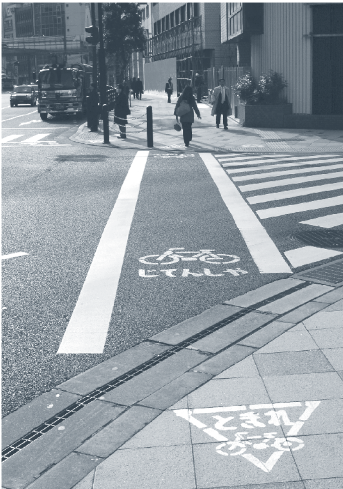
Figure 11. A crosswalk in Tokyo with separate lanes for bicycles and pedestrians.

In Australia, pedestrians were also the focus of many infrastructure improvements. These improvements aid all pedestrians, not just older persons, by providing better visibility of the crosswalk to approaching vehicles. Figure 12 shows a raised crosswalk with curb extensions in Sydney. This design shortens the walking distance for pedestrians, reducing the time they are exposed to traffic. The curb extensions also bring the pedestrian closer to the travelway, making the waiting pedestrian more visible to approaching motorists. Figure 13 shows a shopping area that uses curbside fencing and landscaping to channelize pedestrians to the crosswalks. In addition to parking restrictions near crosswalks, the landscaping provides a mechanism to provide bump-outs that shorten the