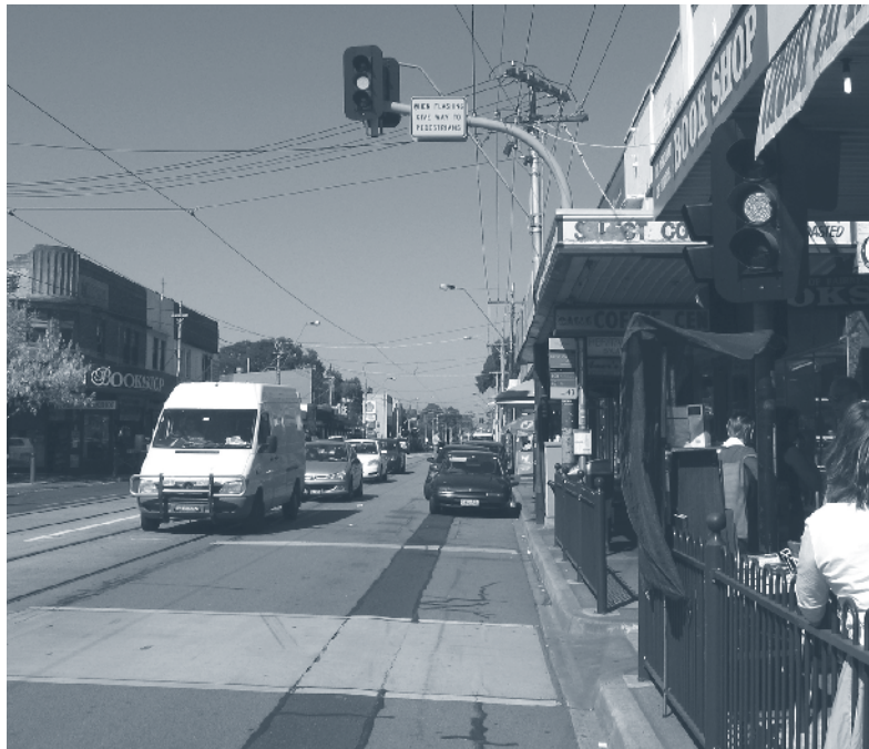
Figure 14. Midblock pedestrian-actuated crossing with pedestrian fencing in Melbourne, Australia.

walking distance at the crosswalk. The median island signs and marking also improve the conspicuity of the crosswalk to approaching vehicles. Another example of pedestrian fencing is shown in figure 14. Melbourne also uses actuated pedestrian signals at midblock crossings in areas of high pedestrian traffic.