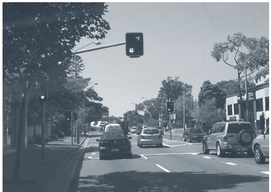
Figure 8. Protected right-turn signals in dedicated right-turn lanes in Melbourne (equivalent to left turn in the United States).

For urban intersections, the most common improvement was to add a protected right-turn (left-turn in the United