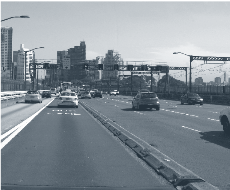
Figure 18. Bus lane with red pavement on the Sydney Harbor Bridge.

lane assignment through complex intersections. In lane guidance applications, the colored pavements match the colors of route legs shown on accompanying diagrammatic signs. This could be particularly advantageous to older drivers, especially in decreasing decision time at information-rich locations. Australia reported some recent developments in materials with durable color and sufficient pavement friction to not pose a safety hazard to pedestrians and cyclists. While these materials appear to show promise, thorough evaluations of material durability and driver behavior have not been completed. This is an area for future research in the United States.