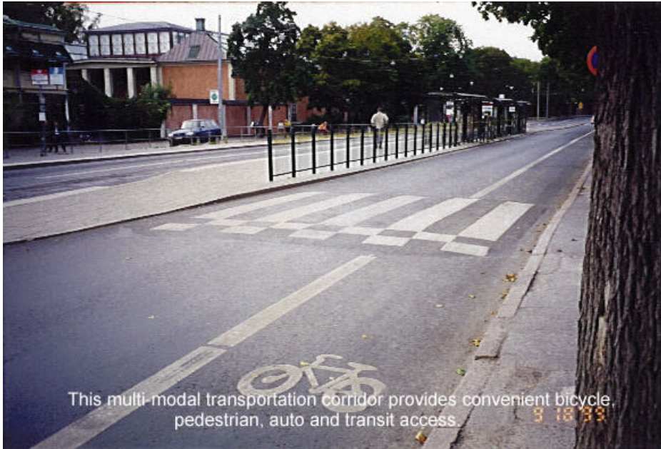
This multimodal transportation corridor provides convenient bicycle, pedestrian, auto, and transit access.