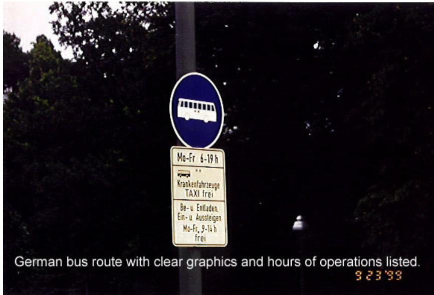
German bus route with clear graphics and hours of operations listed.

use plans and policies that reinforce existing centers and discourage or ban greenfield stand-alone malls.