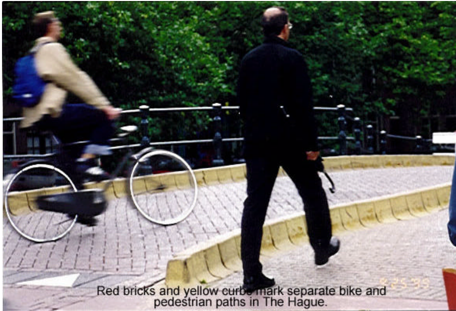
Red bricks and yellow curbs mark separate bike and pedestrian paths in The Hague.